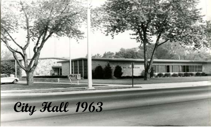
City Hall 1963